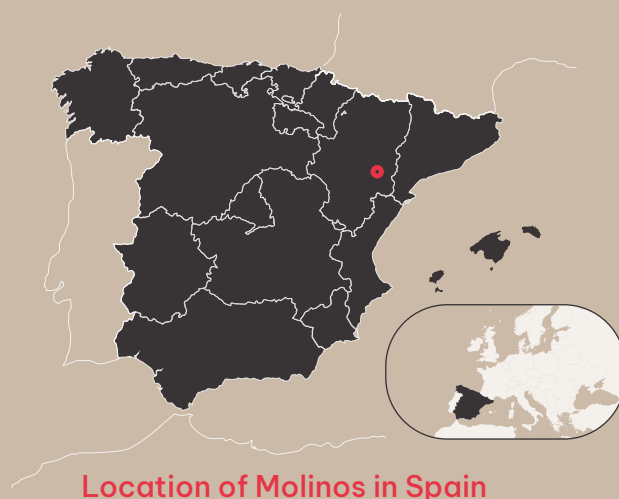
Location of Molinos in Spain

Geologically , it is part of the Eastern Iberian Mountain Range, very close to the area of the link with the Coastal-Catalan Chain, right in the contact units between the Ebro depression and Gúdar-Maestrazgo mountain ranges. The climate is continental-Mediterranean, predominantly dry and sunny, and windy at certain times of the year.